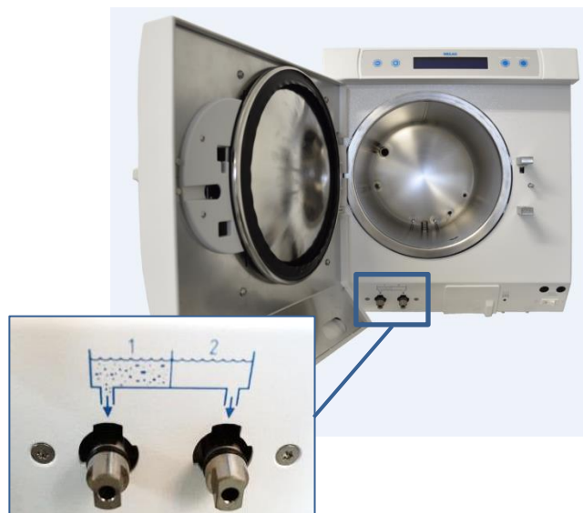
Fig. 1: Connections for emptying the storage tank

In the past, there was a risk of clogging of the water filters in the drainage section. For this reason, we have converted the autoclaves mentioned above to the drain valves already proven in the autoclaves of the Premium Evolution class. The previous plug-in couplings are replaced and the water filters are no longer required.